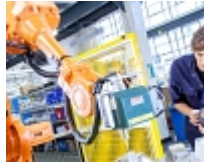
Automated Part Marking