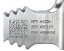
Aerospace Marking Standards