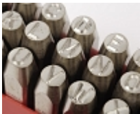
Hand Tools for Marking and Identification