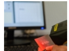
Production Data Monitoring