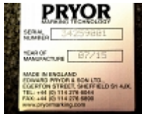
Serial Number Marking