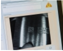
Traceability and Data Capture