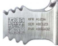
Aerospace Marking Standards