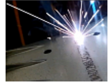
Automotive VIN Marking