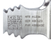
Aerospace Marking Standards