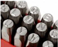
Hand Tools for Marking & Identification