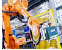
Automated Part Marking