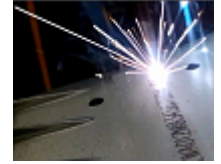
Automotive VIN Marking