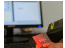
Production Data Monitoring