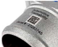
Serial Number Marking