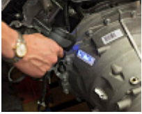
Traceability Software & Data Capture